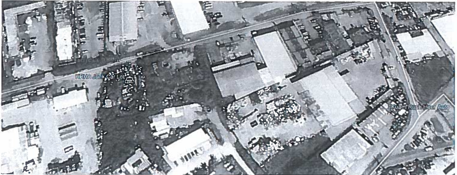
Figure 1. Subject area lined in Red