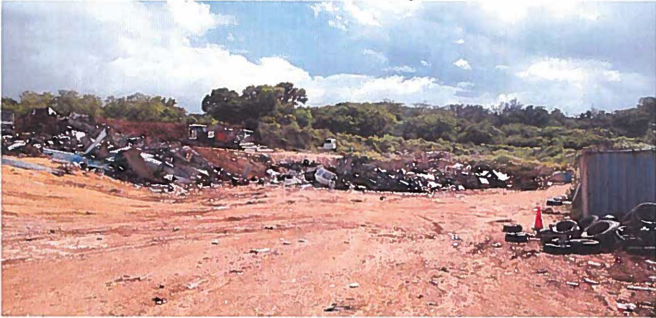
Pic. 1 Date: July 12, 2021 Time: 1542 hrs. Location: Lot No. 3339-4-A-4 , Disposal Site 1: Screening Area Description: Left of the pic. Junk heavy equipment and mixed metals; Center mixed solid waste, Tire piles next to 20' shipping container