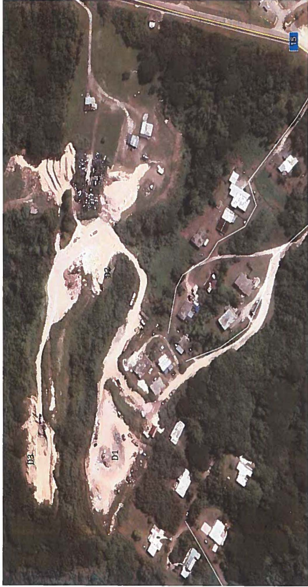
Figure 1: Disposal Site locations: D1, D2, and D3

UMS Hardfill, Mangilao Lot #: M05 L5231-2-2 Dededo, Guam