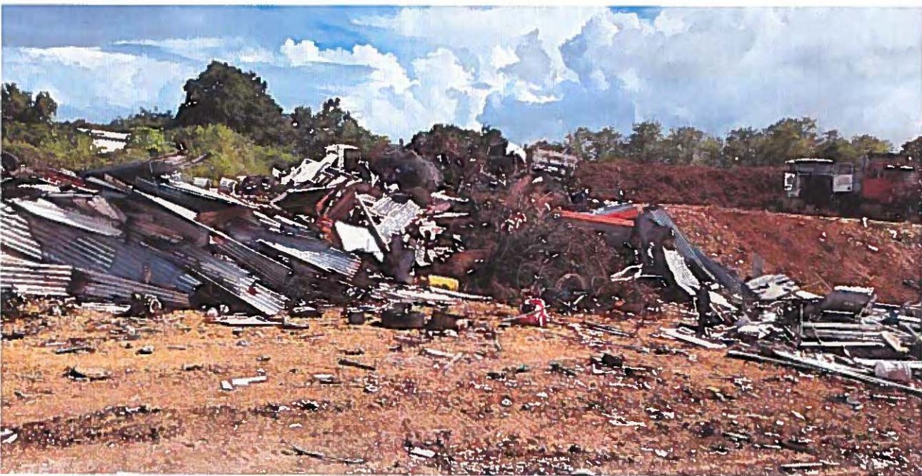
Pic. 2 Page 6 of 20 NOV/OC