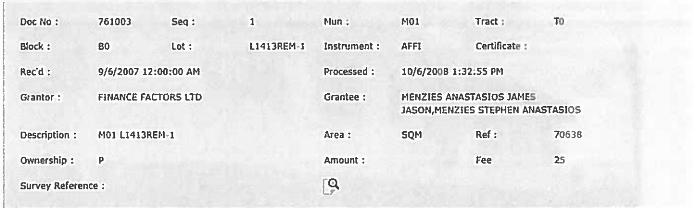
Fig. 1 Department of Land Management Documents of the last registered owner: