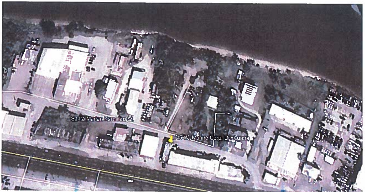
Figure 1. Subject pinned in yellow